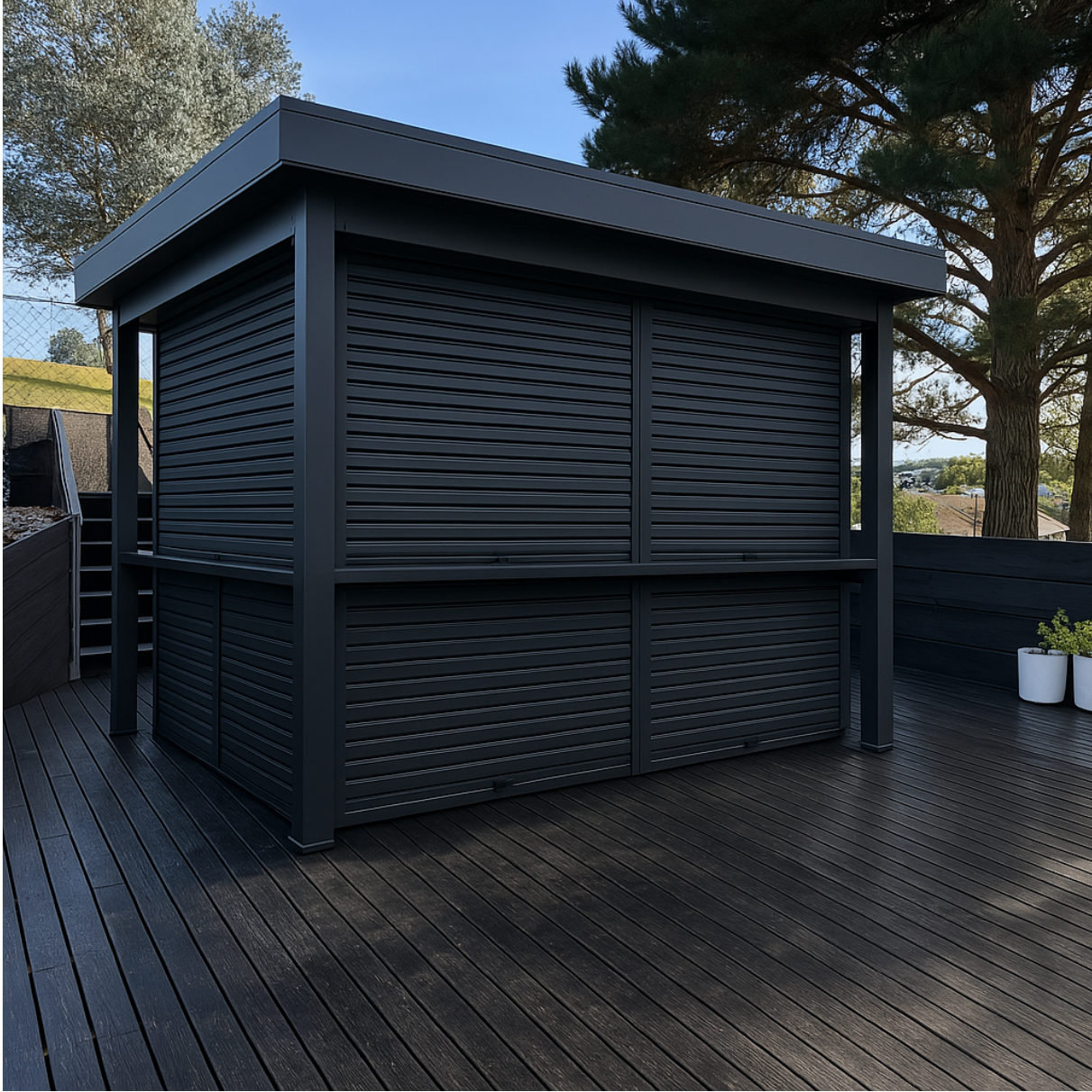
Fully Enclosed BBQ Shed Concept (Roller Doors)