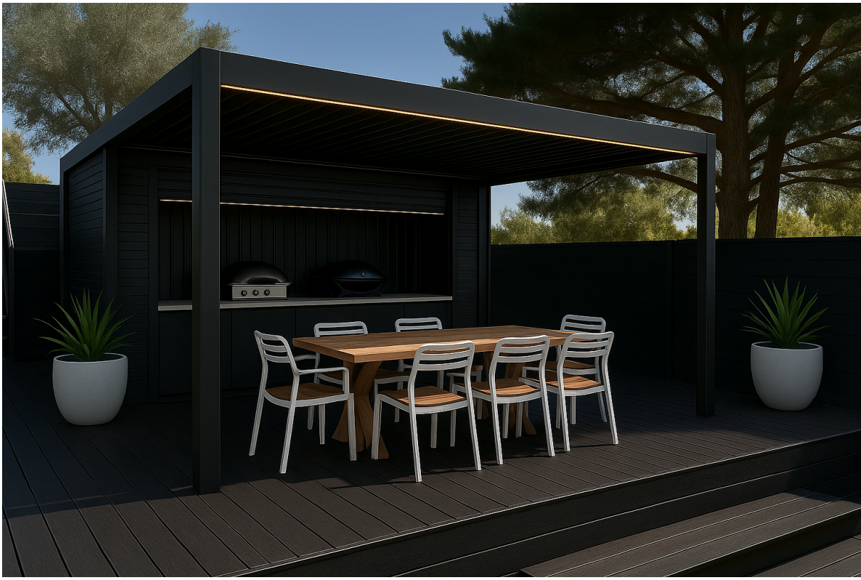
Final Mockup - Outdoor Kitchen + Pergola (Perspective View 2)