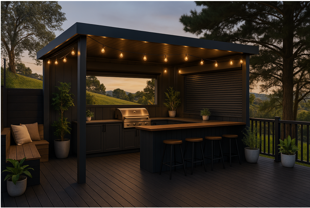
Evening Entertaining Concept - Lighting + Bar