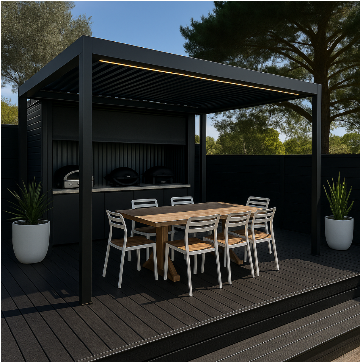
Final Mockup - Outdoor Kitchen + Pergola (Perspective View 1)