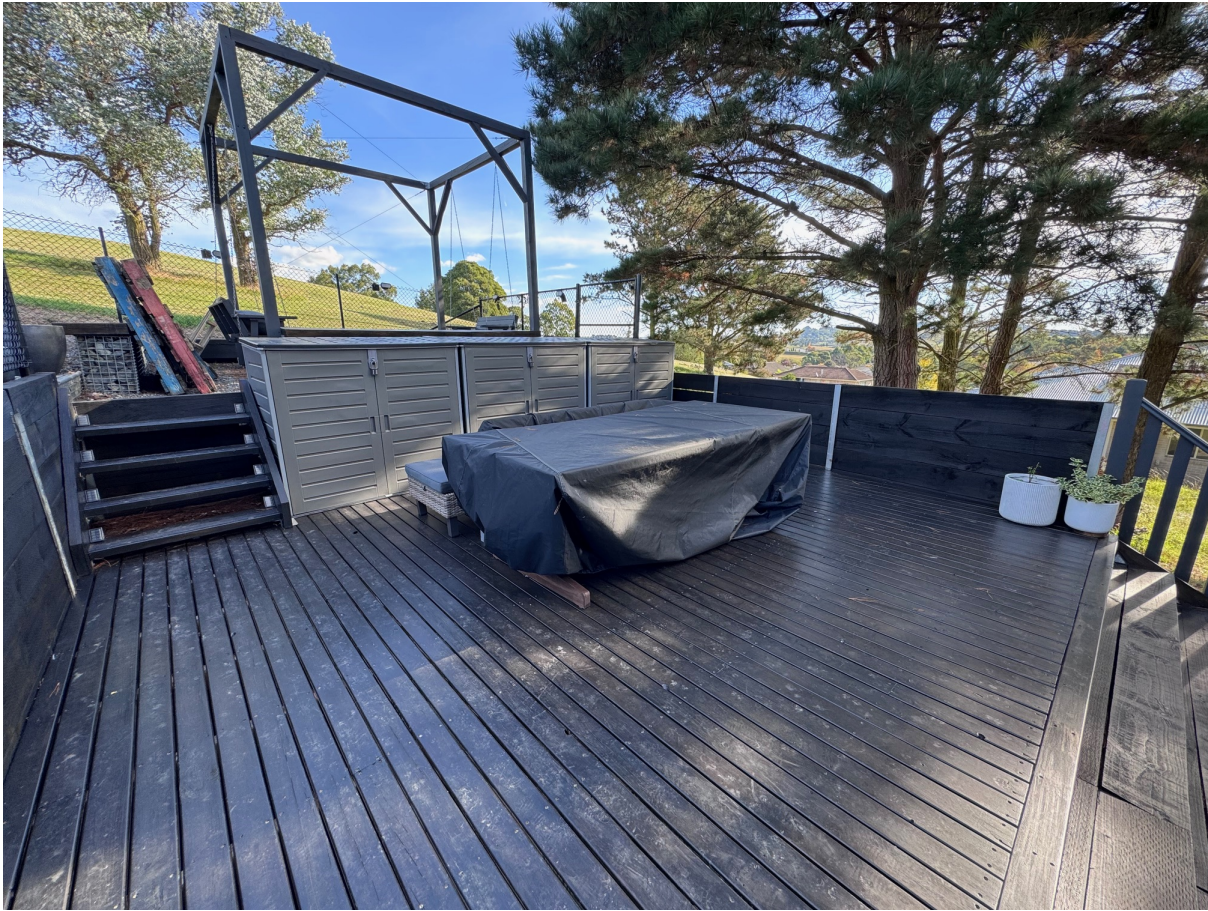
Current Deck Area (5x5m site)