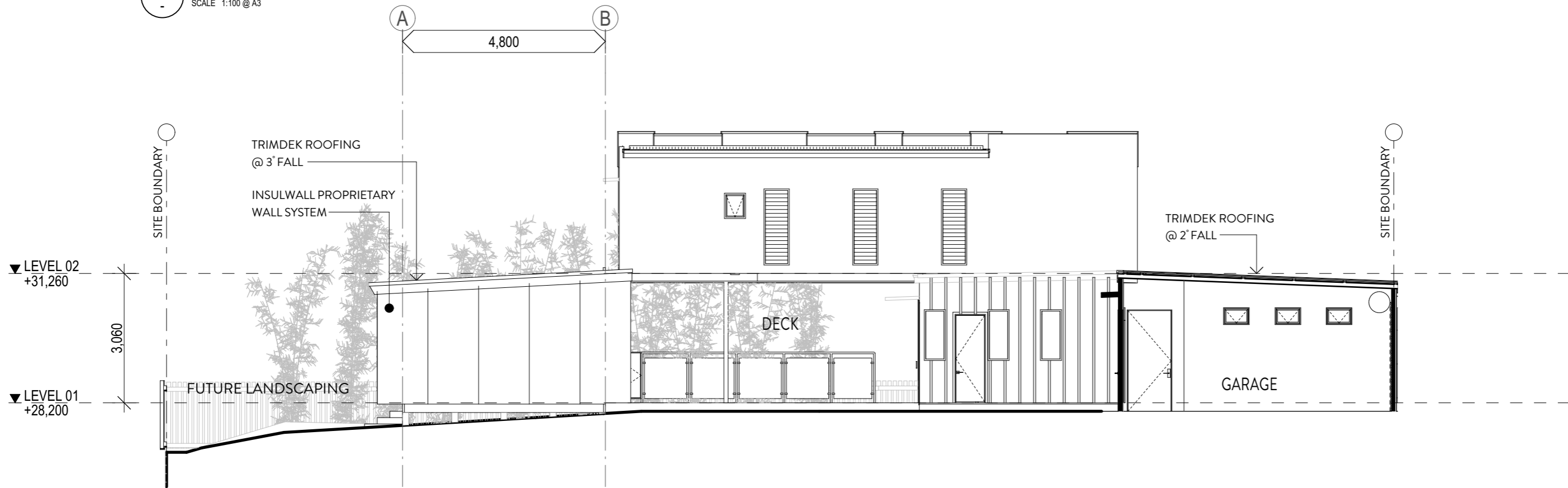
E-04 PROPOSED WEST ELEVATION SCALE 1:100 @ A3