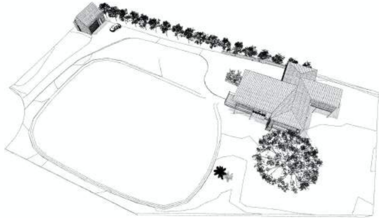
1 PERSPECTIVE NTS A06