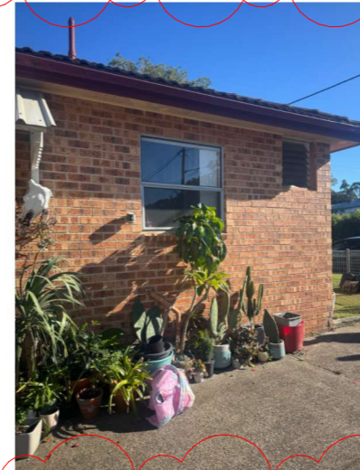
EXISTING WINDOWS - ENSURE VIEWS OUT REMAIN