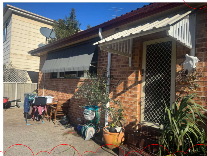
EXISTING WINDOWS, DOWNPIPE AND BACK DOOR STEPS