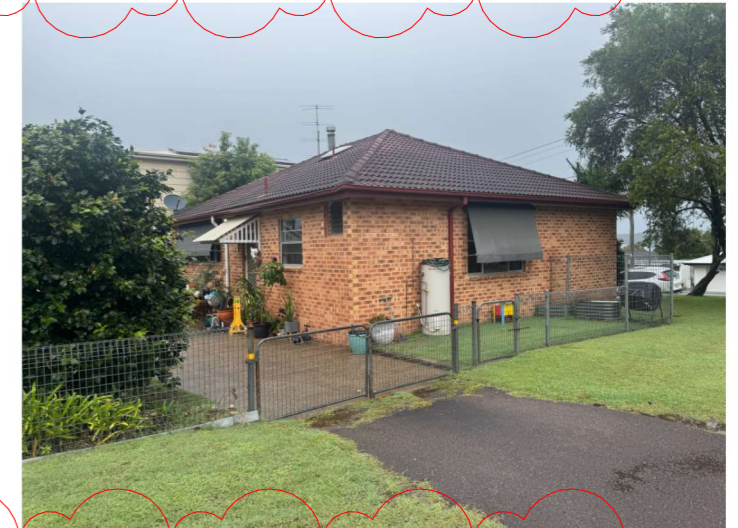
EXISTING PRIMARY DWELLING AND DRIVEWAY