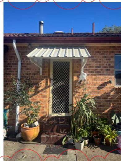
EXISTING BACK DOOR STEPS