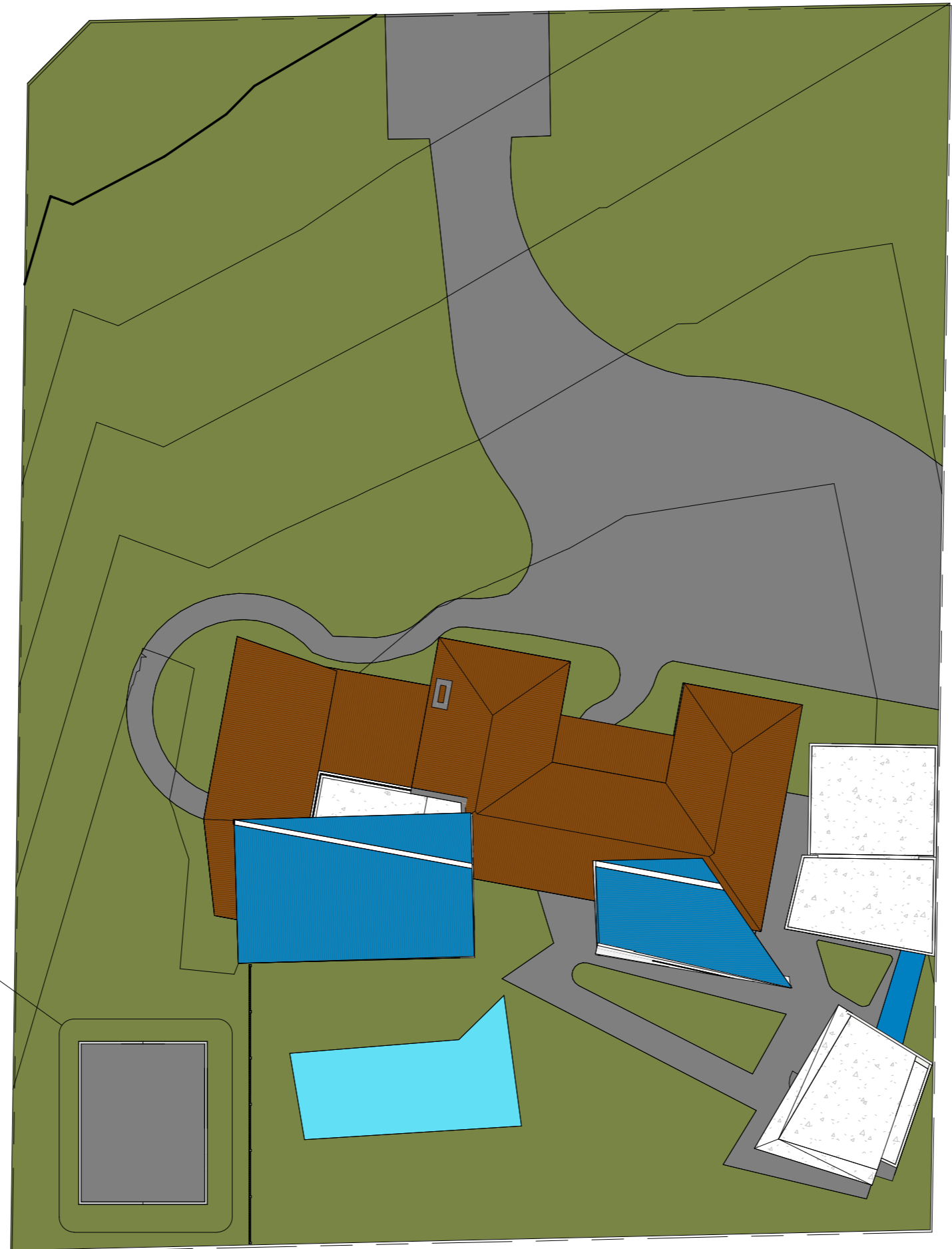
1 Site Plan - True North 1 : 250